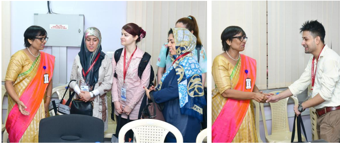
Proceedings of Inaugural Ceremony